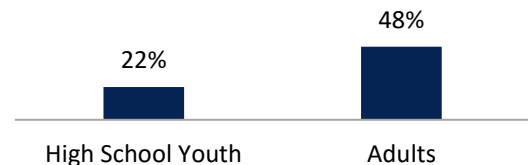
Prevalence of current smoking among current e-cigarette users, Indiana youth and adults, 2018 2,5